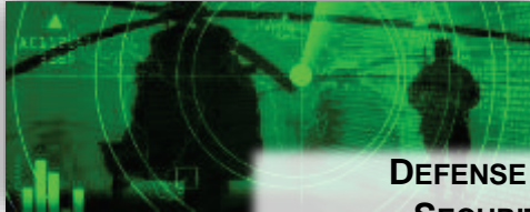
DEFENSE & SECURITY

SwRI's diverse, collaborative teams of scientists and engineers work for government and industry clients globally on projects spanning DEEP SEA TO DEEP SPACE® ... and everything in-between. We are committed to advancing science and applying technology for the betterment of humankind.