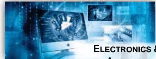
ELECTRONICS & AUTOMATION

We design and develop custom software programs and products, robotics, automated manufacturing systems, communications electronics, and industrial engineering solutions. Our programs are used in operations and maintenance for military and commercial manned aircraft, unmanned aerial vehicles, and training systems.